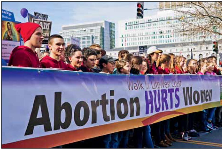
Young people carry a banner during the 14th Annual Walk for Life West Coast Jan. 27 in San Francisco.