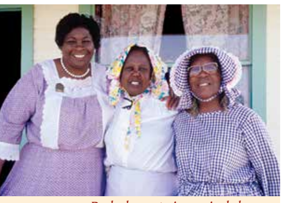
Park docents in period dress

Every year, following the harvest, the town of Allensworth had a big party—this is the time of year when the carnival came to town. The Old Time Jubilee recreates this festive atmosphere.