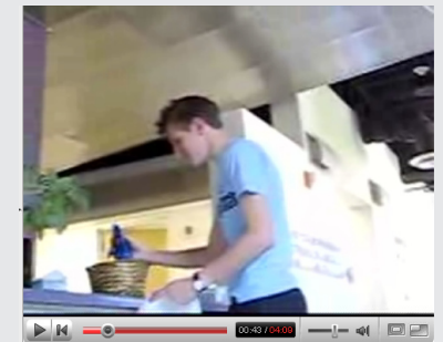
Student grabs Ashe condoms for “orgy.”