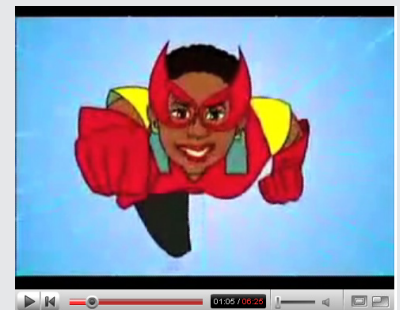
Planned Parenthood's “superhero” promises never to discriminate.