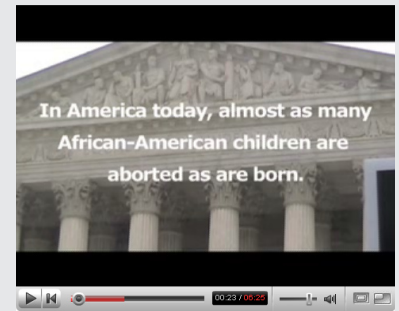
Almost as many African-American children are aborted as are born.