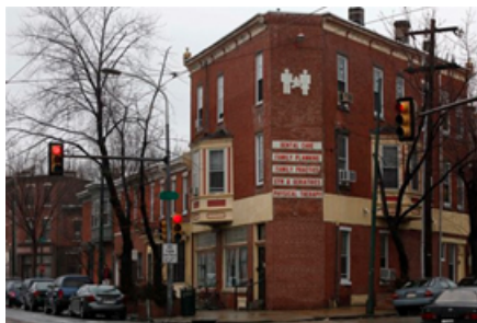
Kermit Gosnell's run-down House of Horrors

Philadelphia, PA – More details are emerging about Philadelphia abortionist Kermit Gosnell, whose license was suspended Monday after authorities investigating an abortion death discovered dozens of fetal remains and "deplorable and unsanitary" conditions at his seedy abortion clinic.