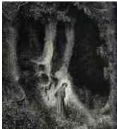
Satan has a blog and a book. Both