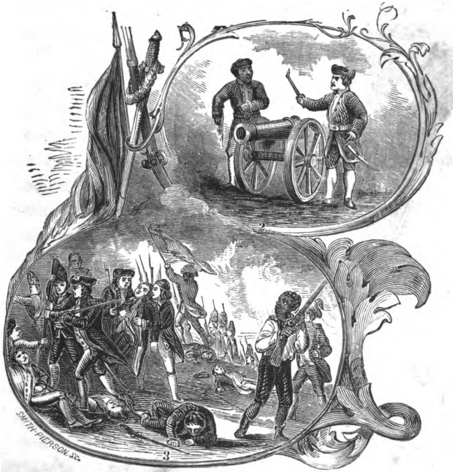
Peter Salem, the Colored American, at Bunker Hill. Page 21.