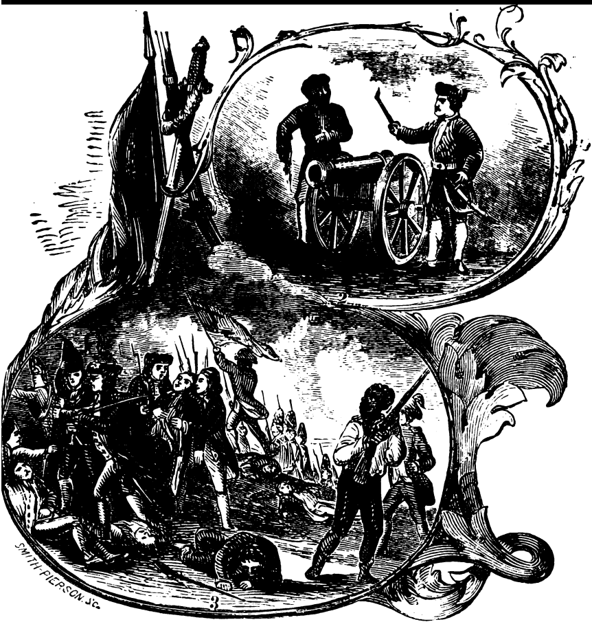
Peter Salem, the Colored American. at Bunker Hill. Page 21.