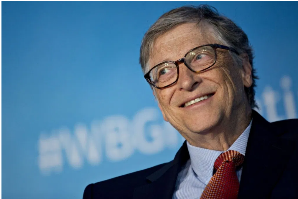
Shining the light on the Gates family.

What is the true story behind Bill Gates and his family? Should we trust his COVID-19 advice?