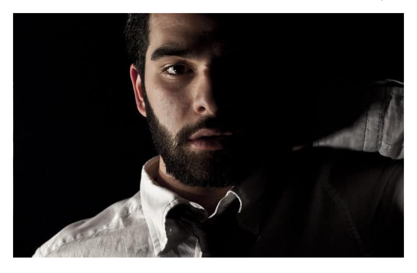
By HLI Staff | October 27, 2021

Many people think that abortion is just a "woman's issue." But they don't understand that it affects the father as well, for he too loses a child. Further, the man often experiences the same types of emotions that a woman experiences after the loss of a child. And though very little research has been done on post-abortive men, the fact that post-abortive ministries now usually include services for men are evidence that men hurt too.