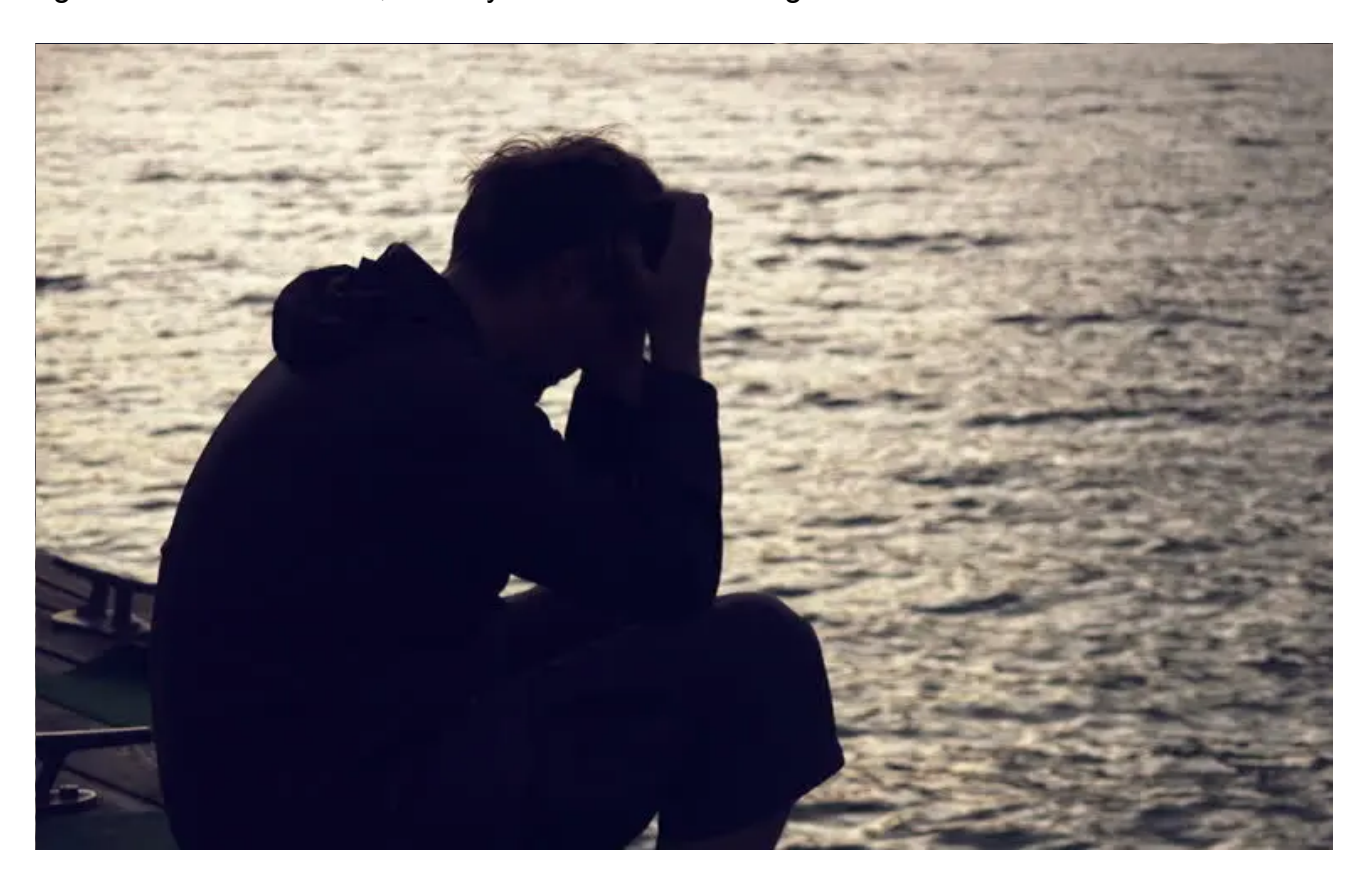
PATH—Post-Abortion Treatment and Healing—is a "community that offers hope and healing to women and men who have been negatively impacted by abortion." It states on its site:

This leads to the father feeling helpless and alone. Regardless of whether he initially agreed with the abortion, he may soon find that he regrets the decision.